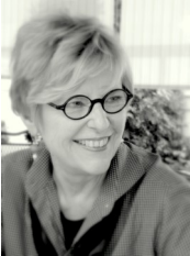
Wellness Trends in Senior Housing Design and Programming