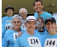
Judson Park Residents Explain Masterpiece Living