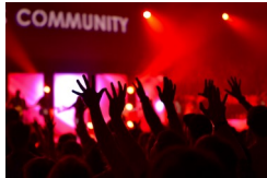
Community Wellness and Mission