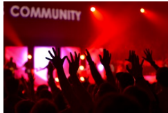
Community Wellness and Mission